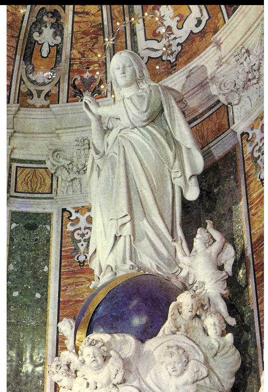
Statue of the Immaculate Conception Chiesa del Gesu' Nuovo, Naples, Italy

consequence of goodness. Just as a thing cannot be at the same time black and white, because being one thing implies that it is not its opposite. Holiness and sin are two things which are the exact opposite of each other. "Nothing defiled can enter Heaven." Nothing that is opposed to God's infinite holiness can approach that burning fire without being at once shriveled and scorched. "Our God is a consuming fire." If, by impossibility, a sinner could enter Heaven, he would be in agony, he would feel so utterly opposed to God's purity and holiness, that his overmastering craving would be to fly to the uttermost distance to hide himself from that burning flame of the all-holiness, the purity of God. Thus you see there must be a place for those who deliberately choose not to have God. Even if they could have Heaven, they would find it intolerable. The defiled cannot by any possibility mix